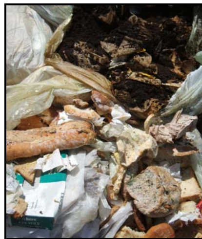
Figure 15--Residuals from bakery cafe: Coffee grounds and filters, bread items, vegetative waste, MCs and waste paper.

Is there a special receiving area for their arrival and/or processing? "No. Large loads of non-bagged food residuals are received and mixed adjacent to windrow of destination, incorporated into that windrow, then covered with a 3" layer of carbon materials. Residuals in compostable bags are incorporated directly into piles, with no additional cover needed."