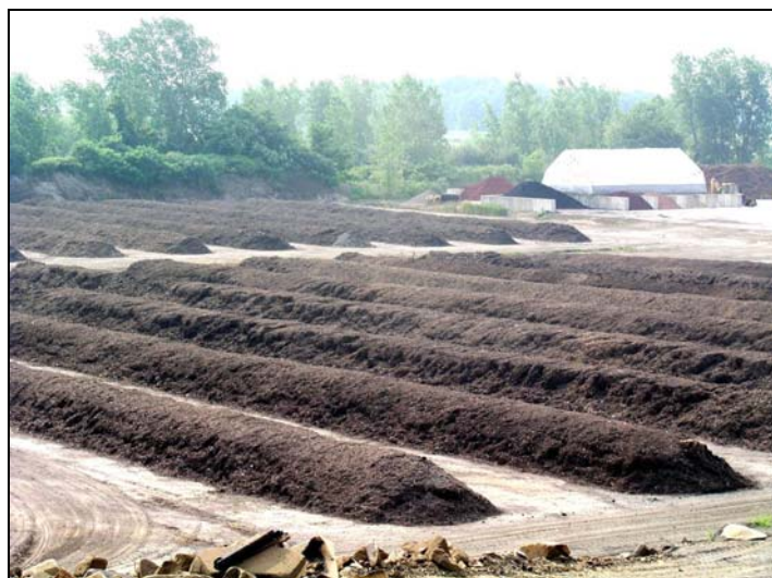
Figure 16--Windrows at Barnes Nursery, Inc., above. Hazel removes contaminants from windrows daily, right.

Special Note: Barnes Nursery also indicated that in their county they must pay a $5/ton fee on food residuals diverted from the county landfill, as the county needed to recoup revenues lost resultant of diversion. While the county wants to be supportive of waste reduction efforts, it loses money by doing so. Sharon Barnes noted that in diversion programs it's essential to find a win-win situation for all involved--for the generators, the haulers, the landfill and the composter. Otherwise, diversion programs won't be sustainable over the long run.