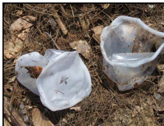
Figure 6--PLA beverage cups, paper cups, paper napkins and bagasse plates, left; PLA beverage cups beginning to degrade after composting 30 days, above.

Manufactured compostables are increasingly popular and can be very useful, hence the composter should become acquainted with requirements to successfully process them. According to the manufacturers of these products, being "compostable" means composting will occur under average conditions at a commercial composting facility . "Average conditions" include UV exposure, 50% moisture content, average temperatures of 140°F, and aerobic conditions (Anaerobic processes were found to be insufficient). Being derived from different materials, items require different processing times: