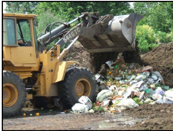
Figure 13--Newly arrived food residuals are immediately covered with ground yard waste at Barnes Nursery, Inc. (see, Section 4--Case Studies).

All the While Protecting Health. Because food residuals contain human pathogens, fungi and bacteria, safeguarding people in contact with these materials is important. When processing food residuals, workers should wear protective gloves (and eye wear to protect from splatter, if workers are directly in contact with materials), and keep hands away from face--especially the mouth and eyes. Hands should be cleaned with antibacterial wipes or soap after contact with residuals. Shoes should be checked for contamination and cleaned as needed. Equipment, too, should be washed after handling food residuals, as bacteria and pathogens can spread into finished piles if touched with contaminated equipment. Don't forget the thermometer used to read temperatures in food residual piles: Wash it after every use, and wash the hands holding it, too. Living contaminants can easily be managed by taking precautions and enforcing sanitation.