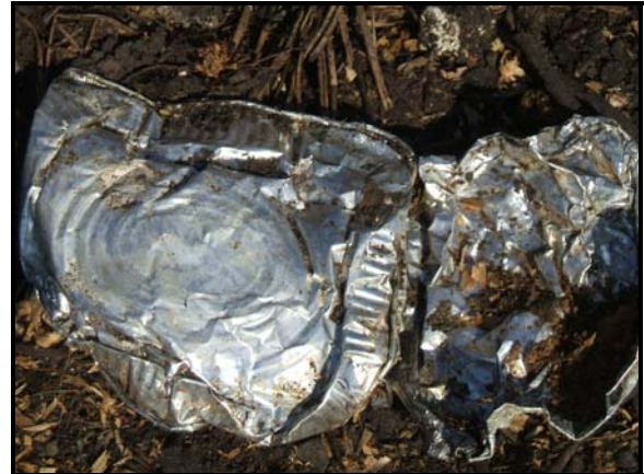
Figure 3--Average contaminants include plastic or latex food processing gloves, plastic wrap, plastic or mesh packaging on supermarket foods, aluminum or plastic food containers, snack bags (chips, etc), and condiment packages from restaurants.

Regular feedback and periodic re-education are also very important. The composter is creating a team effort between themselves and the generator to divert and compost organics. A small investment of time goes a long way toward meeting the team's objectives.