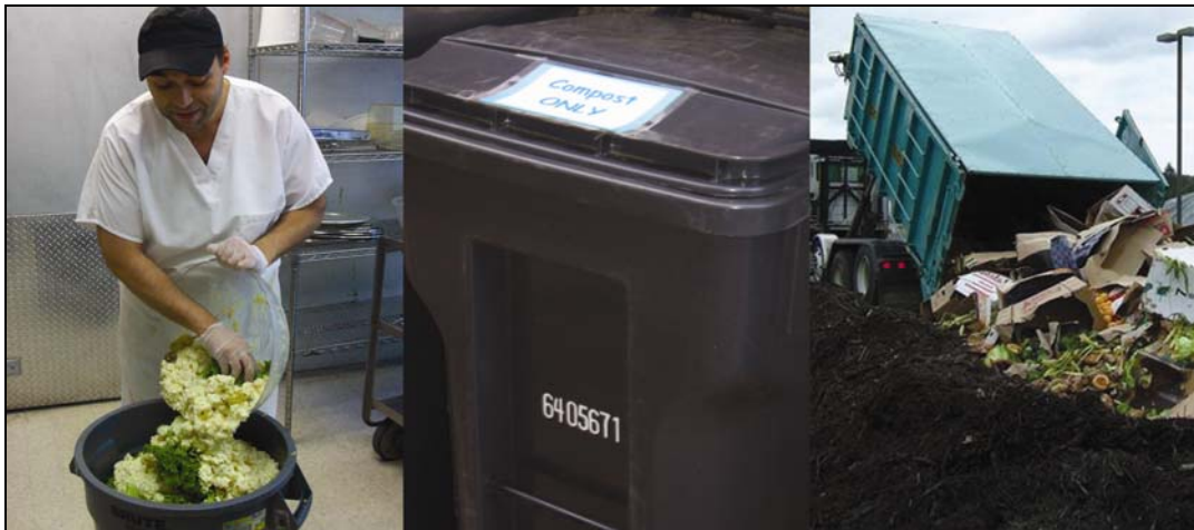
Figure 4--Working with generators of food residuals, from kitchen, to outside storage, to composting facility.