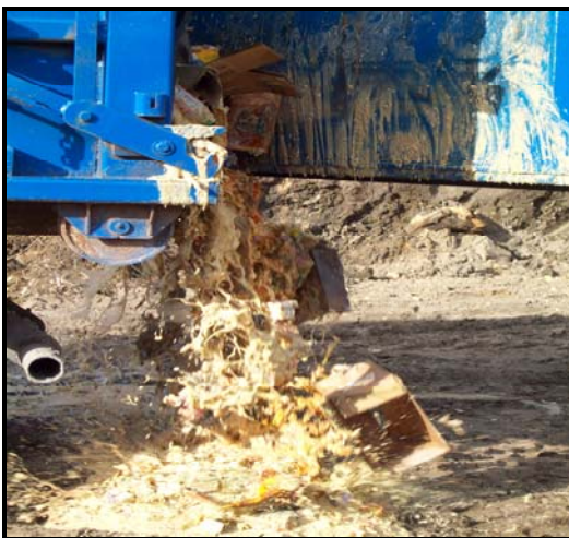
Figure 12--Organics release liquids while awaiting transport--a 20cy load can produce 30 gallons or more. The liquids smell and may contain pathogens, therefore it's important for the composter to be prepared to receive food residuals. Preparation includes spreading a bed of absorbent materials to capture liquids and being ready to mix materials as soon as they arrive.

Manage Liquids First. Because food residuals release liquid while awaiting transport and processing, the composter should prepare to receive the materials in advance of their arrival . Aside from causing odors, these liquids contain nutrients and pathogens hence should not be allowed to travel away from the compost pile. Depending on arrangements with generators, materials will arrive in one of several forms: In compostable bags, in plastic bags (which will require some method of de-bagging), or loose and mixed in a dumpster-type container. Whatever the form, a fair amount of foul-smelling liquids will accompany the organics. Therefore, it's highly recommended to cover the receiving area with a 6-12" layer of absorbent carbon-rich materials onto which the residuals can be placed. (The "receiving area" can be a dedicated location constructed to contain and manage food residuals, or can simply be an area adjacent to the pile where organics will be incorporated.)