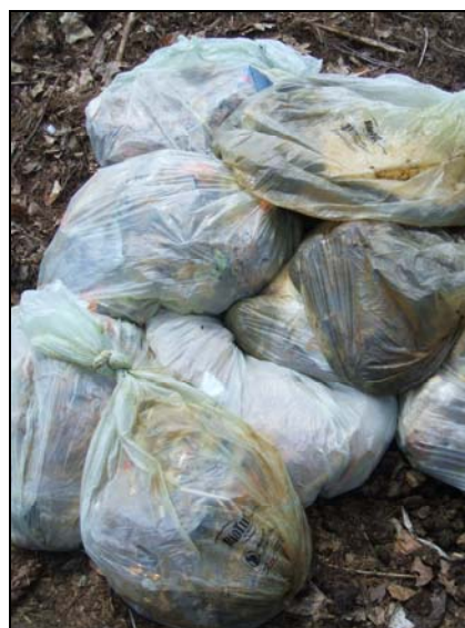
Figure 1--Illustration of "food residuals": Pre- and Post-consumer food wastes, cardboard, and manufactured compostables.